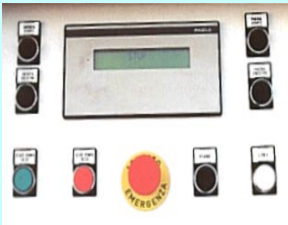
Display and buttons for an easy statement of the Programmes.