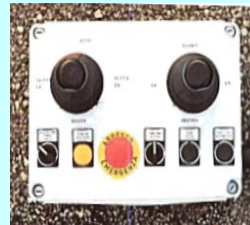
Portable panel for remote control.