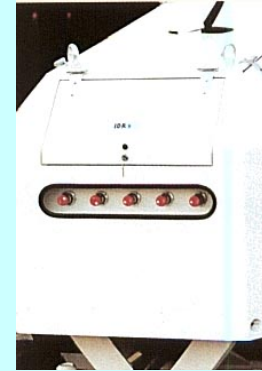
Number 5 speed regulator of nozzle movement.