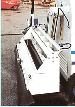
Oscillating protection box for lance & nozzle support.