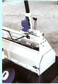
Window to make easy the substitution of nozzle.